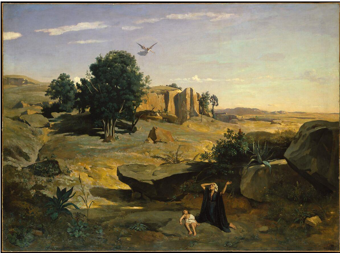
Hagar in the Wilderness, Camille Corot, 1835