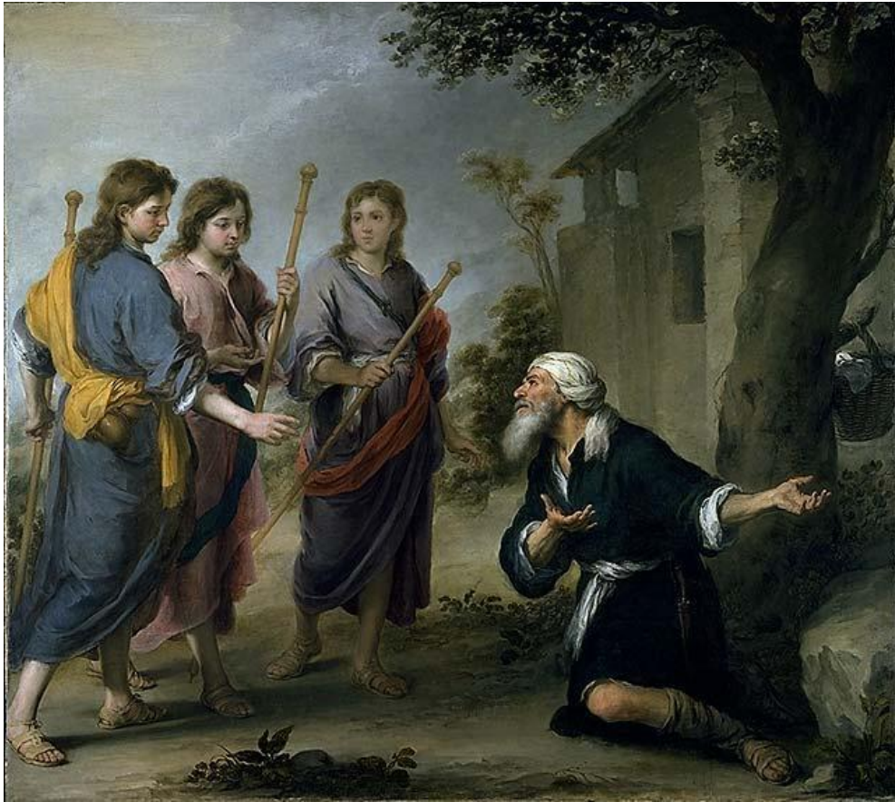
Abraham and the Three Angels (c. 1670-1674) by Bartolome Esteban Murillo